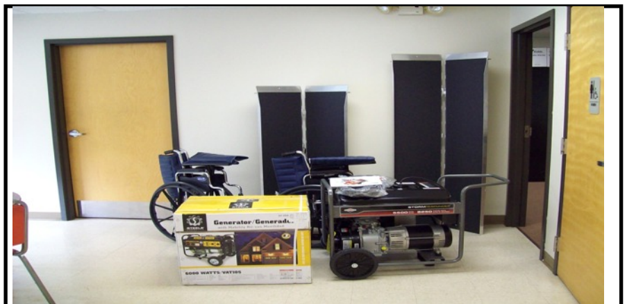
Items from the B.B. & T. Lighthouse Project And American Red Cross